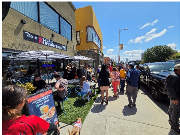
Participants enjoying Filipino food at HiFi Kitchen

A highlight of the event was the curated turo-turo food crawl, which featured stops at three Filipino food destinations in Historic Filipinotown. At HiFi Kitchen, guests enjoyed Filipino breakfast rice meals, as well as ube and coconut drinks. At Korner Hut, participants were served lumpia and classic Filipino refreshments. The tour culminated at Dollar Hits Plaza, where attendees gathered for a community feast that featured pansit , barbecue, sorbetes , and other Filipino treats.