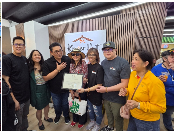
Consulate General and PWC expressing their appreciation to participating Filipino restaurants

The organizers thank Dollar Hits Plaza, HiFi Kitchen, Korner Hut, the Tricycle Operators and Drivers' Association (TODA) group, Pinoy Harley Riders Club, GCash, Imedia Ideas, and the Filipino American Symphony Orchestra for their support in making the event possible. END