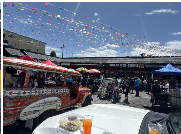
Culminating fiesta and fellowship at Dollar Hits Plaza