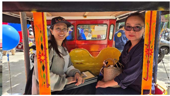
Participants before embarking on the jeepney and tricycle tour