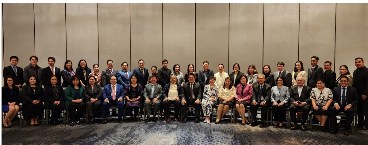
Members of the Philippine diplomatic corps from Foreign Service Posts in the United States, Canada and Latin America

Los Angeles, 25 November 2024 – The Philippine Consulate General in Los Angeles successfully hosted the two-day Regional Assistance-to-Nationals (ATN), Contingency Planning, and Consular Caucus for the Americas Region from 23 to 24 November 2024. The meeting gathered members of the Philippine diplomatic corps from various Foreign Service Posts in the United States, Canada, and Latin America.